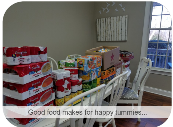
Good food makes for happy tummies...