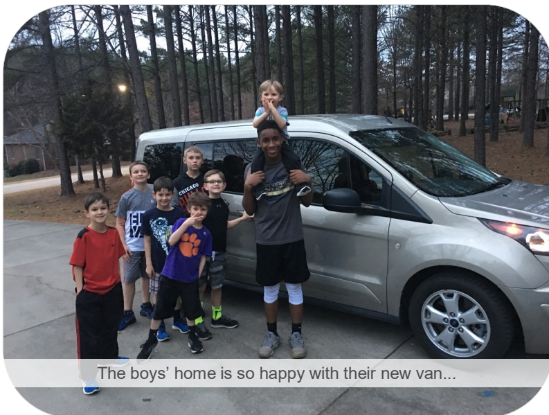
The boys' home is so happy with their new van...