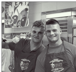
Clemson students serving in the kitchen