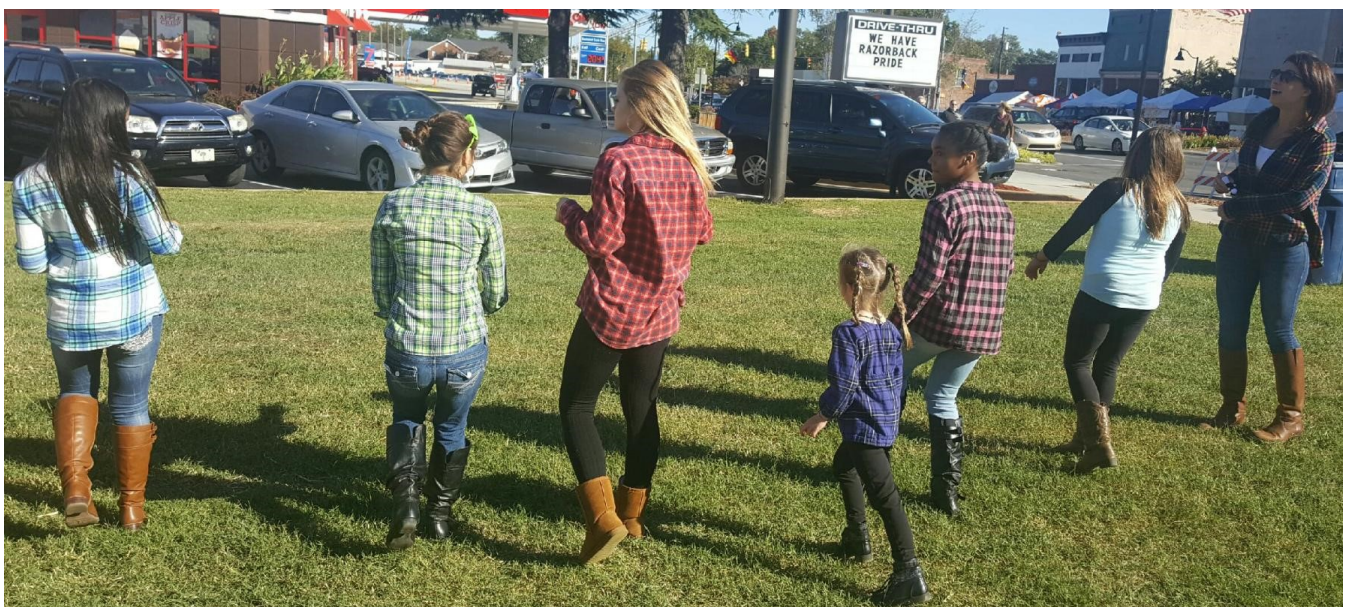
Some of our girls enjoying Oktoberfest activities.