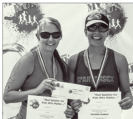
Team: "Just The 2 of Us" & 1st Place 2- person team winners