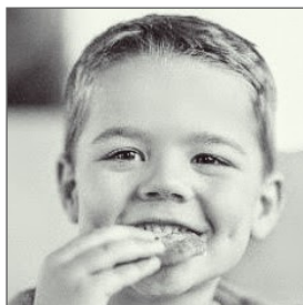
Who doesn't love fresh baked cookies