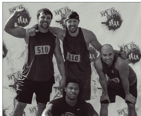
Team: "Has Beens"

To see more pictures of our "4th Annual Collins Home Mud Run" go to our Facebook Page @collinshomemudrun